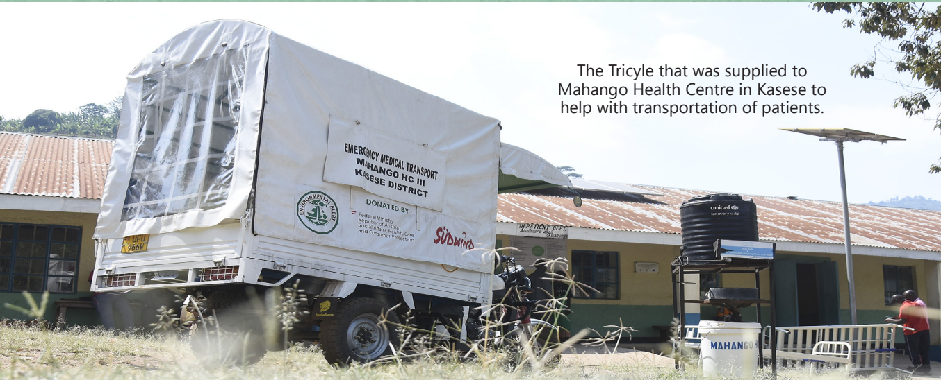
The Tricycle that was supplied to Mahango Health Centre in Kasese to help with transportation of patients.