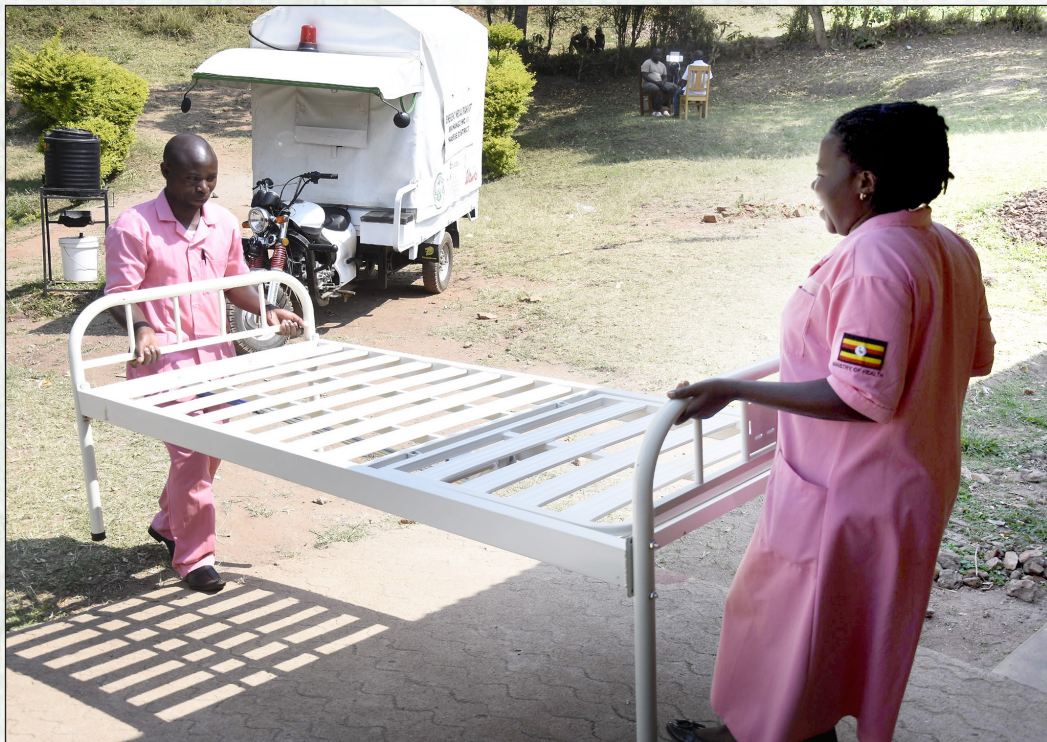
Staff of Mahango Health Centre receiving the hospital beds donated by Environmental Alert as part of the project. In the background is the tri-cycle ambulance that was donated as well.