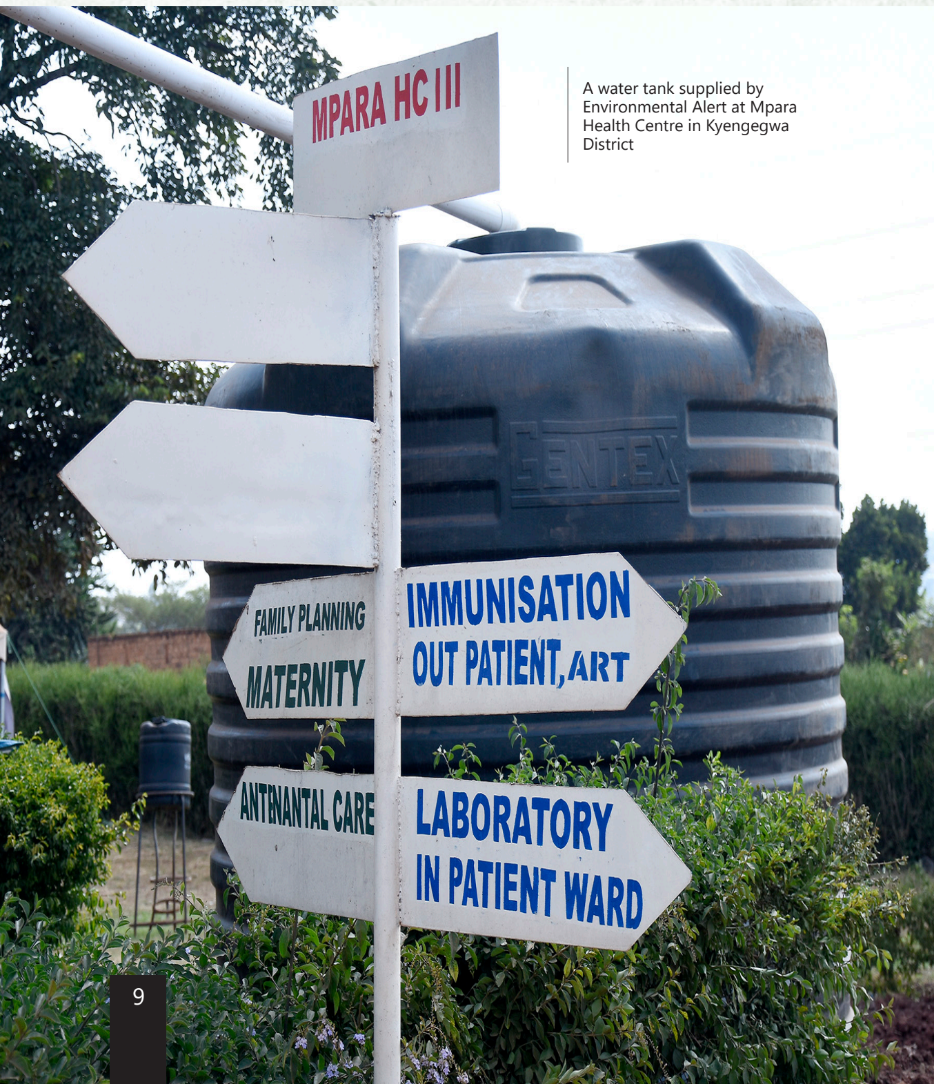
A water tank supplied by Environmental Alert at Mpara Health Centre in Kyegegwa District

As part of improving sanitation and hygiene services in the health centres, two water tanks were provided and installed to the two health centres of Mpara and Mahango in Kyegegwa and Kasese districts respectively.