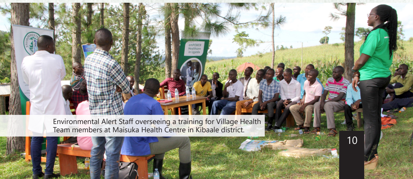
Environmental Alert Staff overseeing a training for Village Health Team members at Maisuka Health Centre in Kibaale district.

VHTs are community-based volunteers responsible for delivery and monitoring of primary health care at the household level. They are the eyes and ears of the State regarding health-related issues at village level. The VHT's received a comprehensive training to improve their communication skills; the training also broadened their knowledge base, hence enabling them to generate monthly reports at the health centre and participate in government programs such as community immunization of babies and conducting of public health awareness. VHTs also received a number of IEC materials to use in their day-to-day work.