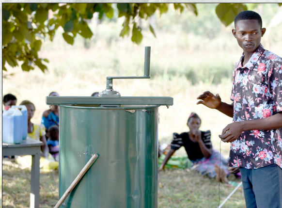
A youth group in Kyengegwa demonstrate a liquid soap making machine they received from Environmental Alert as a way of improving their livelihood

The project carried out training and learning for community groups in the making of liquid soap and making of briquettes as an alternative source of fuel.