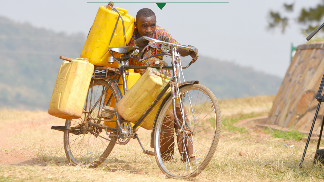
A labourer fetching water at Maisuka Health Centre. The entire district of Kibaale faces long droughts

Somewhere in Kibaale District, in a rural community of Kyakahazire about 250 kilometers from Kampala the capital city of Uganda, EA together with partners like Sudwind (Austrian NGO), a solar power revolution has started. The focus for now is to power community health centers by ensuring that they have the power they need to support all health care services in the community. Energy needs for communities like this one have been growing over the years.