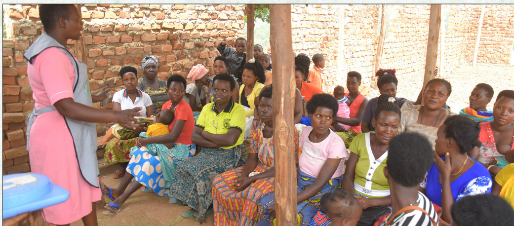
A nurse from Maisuka Health Centre during a community awareness activity