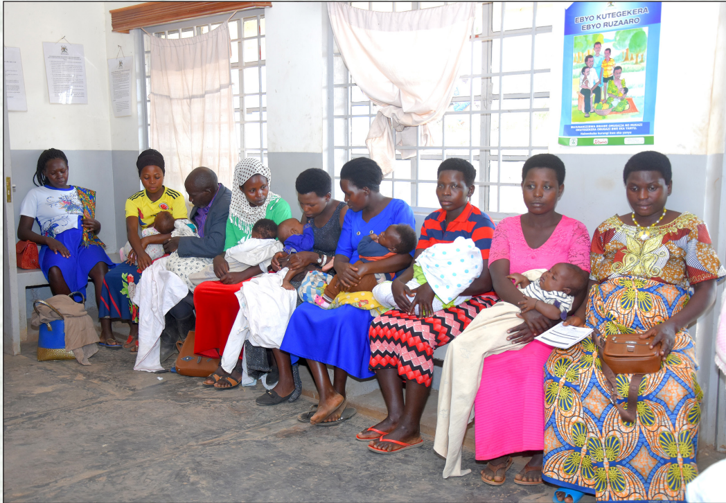
Mothers waiting in line to have their babies immunised at Maisuka Health Centre in Kibaale District