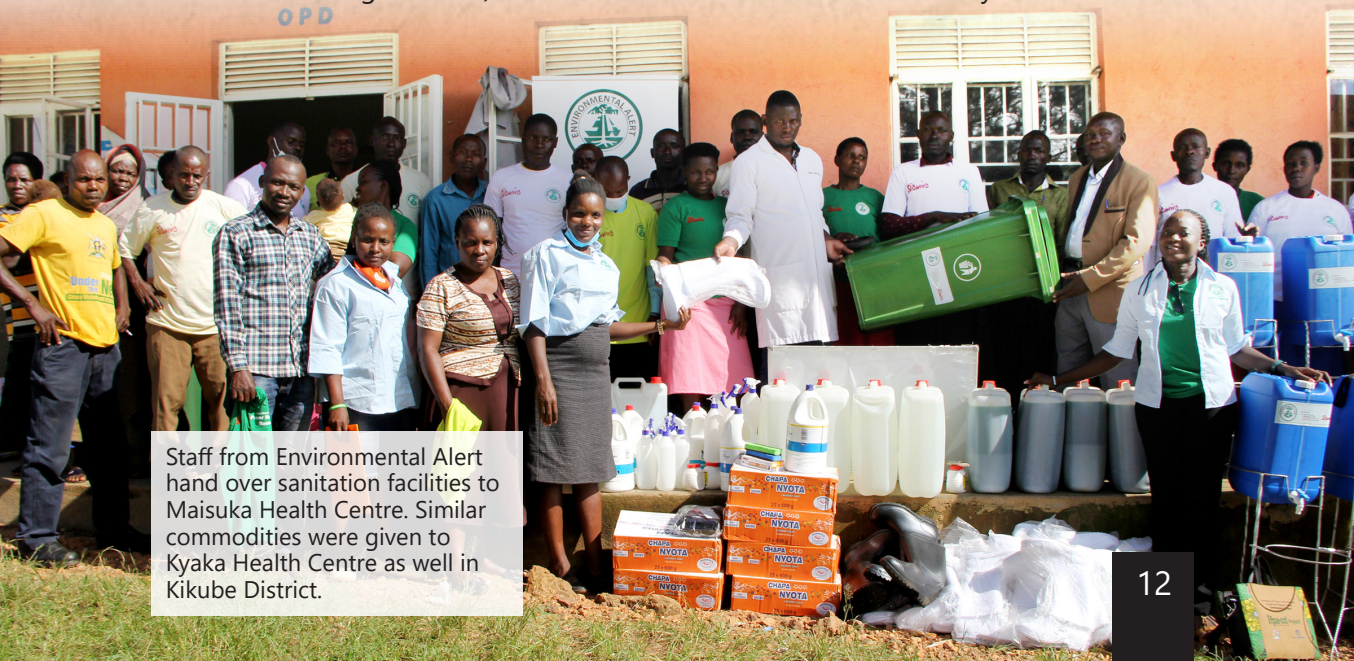
Staff from Environmental Alert hand over sanitation facilities to Maisuka Health Centre. Similar commodities were given to Kyaka Health Centre as well in Kikube District.

– the project provided an assortment of materials (e.g., liquid and bar soap; waste bins and hand washing facilities) to two health centres of Maisuka and Kyaka.