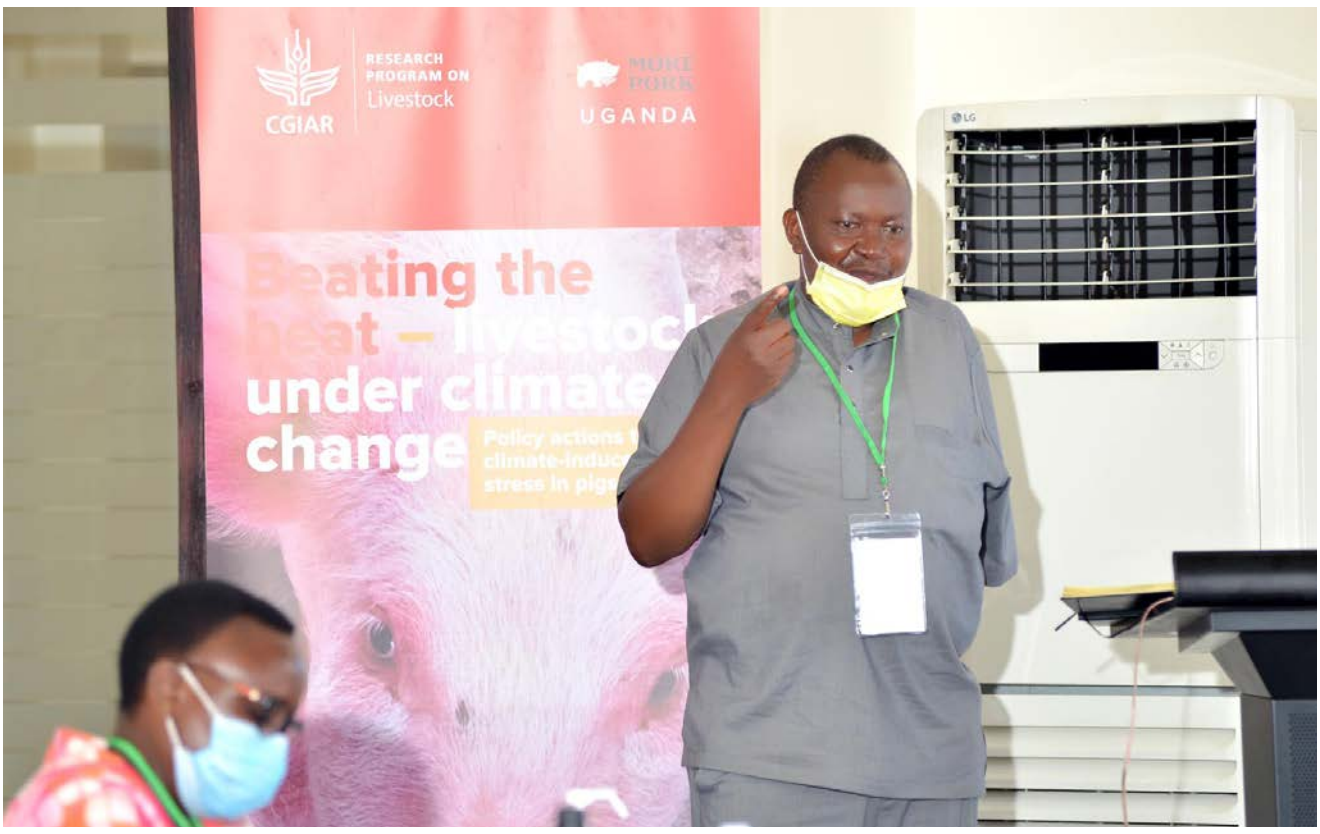
Photo 4: Hon Mathias Kasamba giving his open remarks (Credit: CIAT/ILRI).

resources by repeating what some has been done, 4) synergize our objectives involving the public and private sector, 5) move the discussion from boardrooms and hotels to action, and 6) start taking concrete actions towards the realization of the continent's Climate Smart Agriculture aspirations.