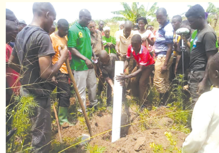
Figure 2. Refugees participating in the demarcation of Kakoni Wetland in Kyaka II refugee settlement.

Civil society have utilized the presidential directive to evict encroachers in wetlands to engage communities; supported communities to develop wetland management guidelines, form wetland management committees and demarcate wetlands. As a result, 1,500 ha of degraded wetlands have been restored , with installation of concrete pillars at the highest water mark of the wetland, in some instances bamboo seedlings were planted at an interval of 5 meters in between the concrete pillars.