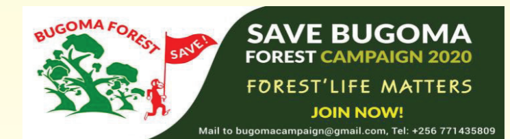
Figure 3. Banner of the Save Bugoma Forest Campaign.

The main governance concerns this year has been the giveaway of part of Bugoma CFR. The ENR CSOs responded to this with a 'Save Bugoma' initiative where CSOs have concentrated efforts engaging different sector actors to address concerns related to management responsibility of the contested area, court cases related to ownership of the land, concerns over the process of issuance of the Environment and Social Impact Assessment Certificate among others.