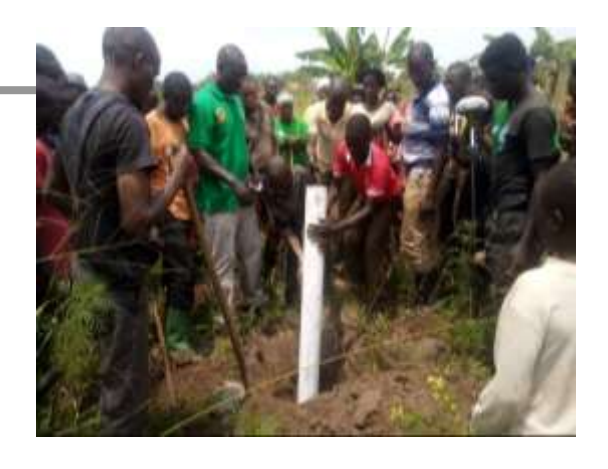
Figure 3: Refugees participating in the demarcation of Kakoni Wetland in Kyaka II refugee settlement.

Consequently, 1,500 ha of degraded wetlands have been restored, with installation of concrete pillars at the highest water mark of the wetland, in some instances bamboo seedlings were planted at an interval of 5 meters in between the concrete pillars.