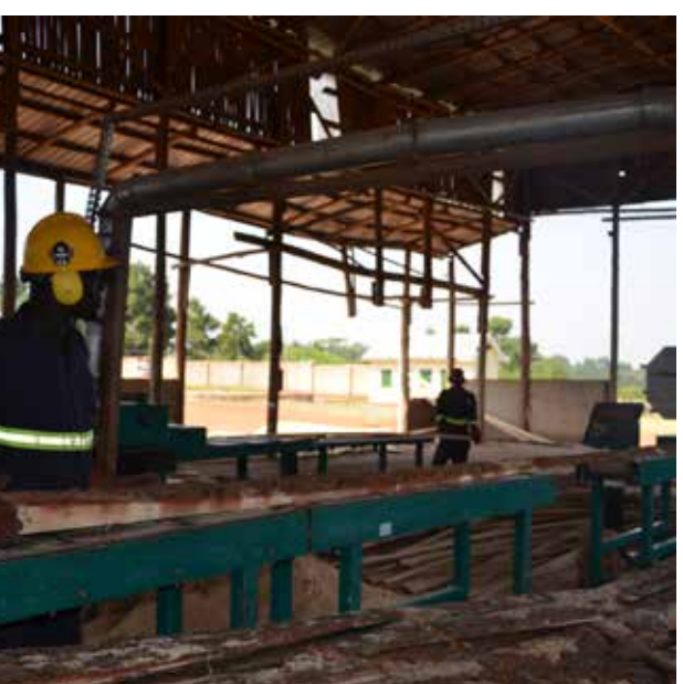
Sawmilling at BFC in Bukaleba, Mayuge District