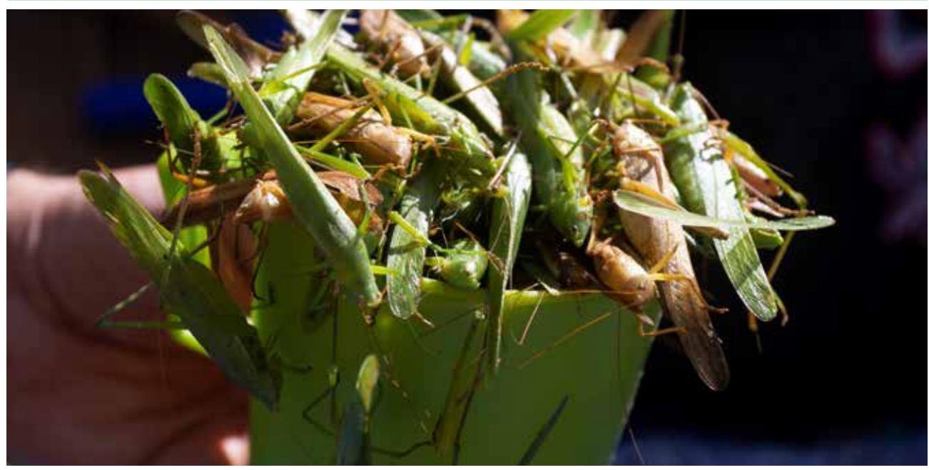
Grasshoppers being sold in Arua

ccording to the State of Uganda's Forests Report, 2016, in some parts of Uganda, the value of Non Wood Forest Products (NWFP) is higher than that of wood products, yet they continue to be considered secondary aspects in forest management and land use planning. NWFP are often considered lesser forestry products or "neglected". The State of Uganda's Forests report notes that NWFP are very beneficial to the country; with honey production ranging between 4 000 and 9 000 metric tonnes but with a production potential estimated at 100 000 to 200 000 metric tonnes of honey per year. In 2009, it was reported that apiculture contributed about USD 17 million to the national economy. Whereas the market for honey is considered to be available in Uganda, information is not readily available. Furthermore, millions of households worldwide heavily depend on wild and semi-wild resources from forests and other wooded land for subsistence and/or income. About 80 percent of the population in developing countries use NWFP for health and nutritional needs because they provide an important source of micro and macronutrients. About 1 billion people globally depend on wild foods. NWFP also provide raw materials for large-scale industrial processing. NWFPs are also significant in global trade, and were estimated to have generated USD88 billion in 2011, according to FAO.