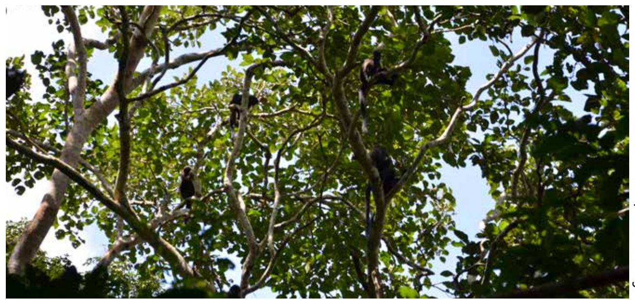
Monkeys in Mabira Central Forest Reserve. Forests are home to biodiversity but deforestation and forest degradation are increasing at alarming rate. Bold actions are required to reverse loss of forests and their biodiversity for current and future generations.

SOFO 2020 therefore calls for bold actions, sustainable solutions and transformations to reverse forest degradation and biodiversity loss for the benefit of current and future generations. Suggested actions include effective governance, policy alignment between sectors and administrative levels, land-tenure security, respect for the rights and knowledge of local communities and indigenous peoples, enhanced capacity for monitoring of biodiversity outcomes and innovative financing modalities to promote forest conservation and poverty eradication among forest-dependent communities.