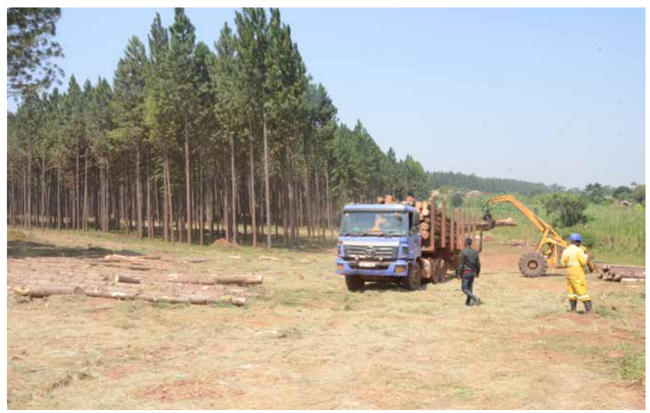
Harvesting and transporting of logs at a forest plantation. Well-planned forest roads enable efficient transportation and safe operations.

Roads are often grossly neglected in plantation forests as they are often not used year-round. Roads cannot be considered an afterthought when timber needs to be transported or access is needed to fight fires. The road network should ideally be planned during plantation development: taking into account, the future users of the road (for example log transport, fire prevention and suppression, silvicultural activities and public needs). The road network also needs to consider the selected harvesting system as it influences extraction distances and landing locations for tree processing and log storage. An optimal road network creates the correct number of roads of the correct class on the correct location to achieve holistic objectives. Managers need training to implement road maintenance strategies that meet user needs and prevent excessive environmental impacts. Certification programmes such as the Forest Stewardship Council (FSC) correctly place much emphasis on the environmental impacts of forest roads. Mitigation of these impacts calls for hands-on managers with good road planning capabilities.