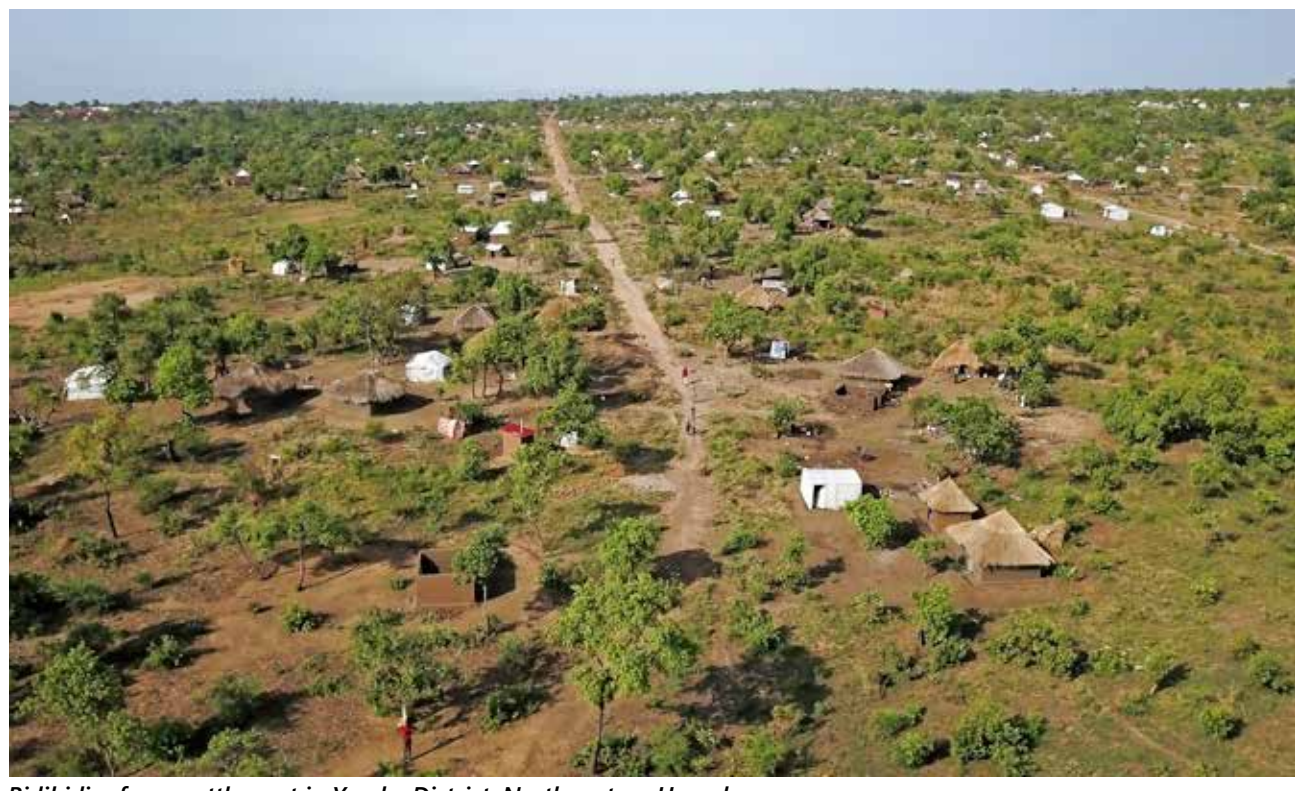
Bidibidi refugee settlement in Yumbe District, Northwestern Uganda