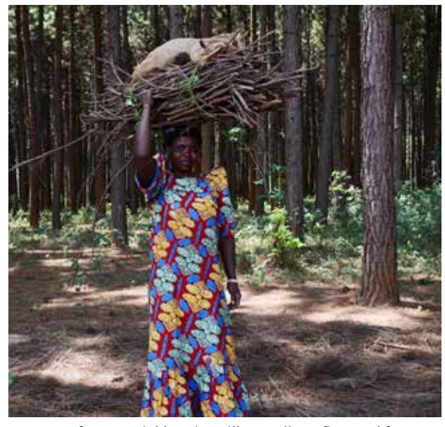
A woman from a neighbouring village collects firewood from BFC's plantation in Bukaleba, Mayuge District

However, many of the communities surrounding our plantations have few or no opportunities to practise agriculture because they have no land. We are working with the National Forestry Authority (NFA) to work out any possibilities of availing land in the forest reserve to local communities.