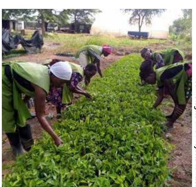
Weeding Afzelia africana nursery bed at Schnelle Aufforstung Technologies und Projects Limited, Omoro District

Afzelia africana seed and seedlings can be obtained from the National Tree Seed Center (NTSC) in Namanve or from FAO/SPGS III certified private nurseries such as Schnelle Aufforstung Technologies und Projects Limited in Omoro district. At NTSC, one Kilogram of Afzelia africana (350-450 seeds) costs UGX 60 000 and a seedling costs UGX 1 000. For those intending to plant large areas, it's advisable to book in advance, to allow nurseries to raise appropriate quantities. Contacts of FAO/SPGSIII (2019/2020) certified nurseries are available via the project website: www.spgs.mwe.go.ug.