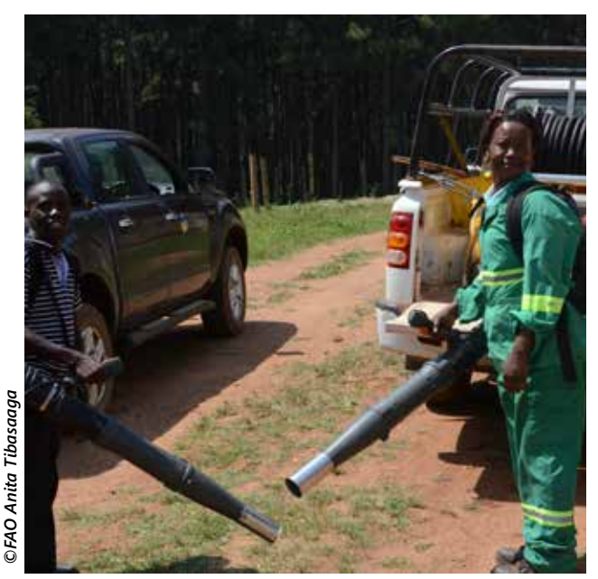
BFC has invested in modern tools, equipment and training to empower its staff