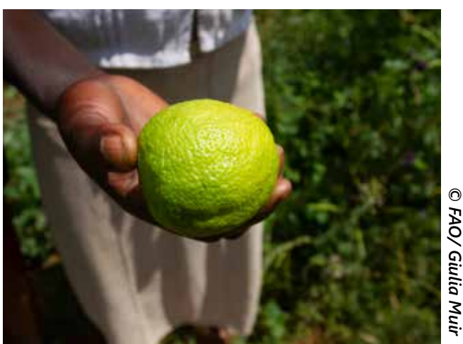
A girl displays wild lemon or kululu, one of the NWFP