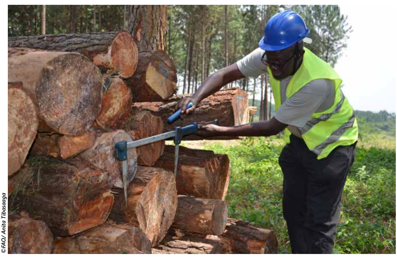
A training participant measures diameter of logs before they are transported to the sawmill

s Uganda's forestry sector continues to grow; with Government, private sector players and communities involved in commercial tree planting, it has become increasingly important to focus on skills development as a mechanism to promote sustainable forest management. Forest engineering is one of the critical skills required for sustainability of commercial forestry. Forest engineering provides the methodology and technology to plan forest operations such as building and maintaining forest roads, harvesting trees, making logs, transporting logs from the forest to the mill, while paying attention to environmental management and health and safety standards. It is against this background that, in February 2020, the FAO/ SPGS III Project organized a Forest Engineering training for key forestry sector players, focusing on Harvesting and Roads.