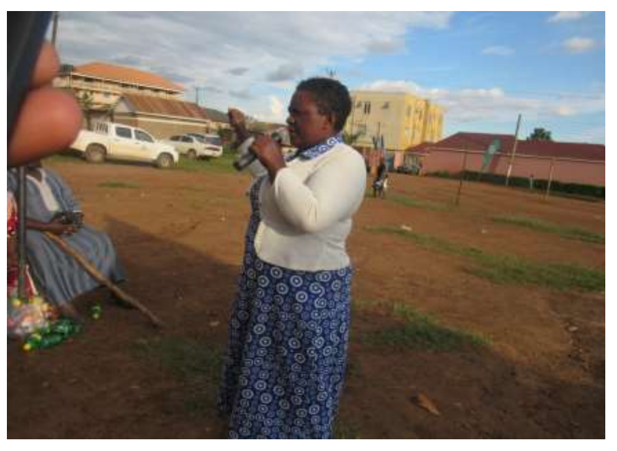
Fig3. Community member raising an issues on water security during the Wakiso cmmunity Baraza