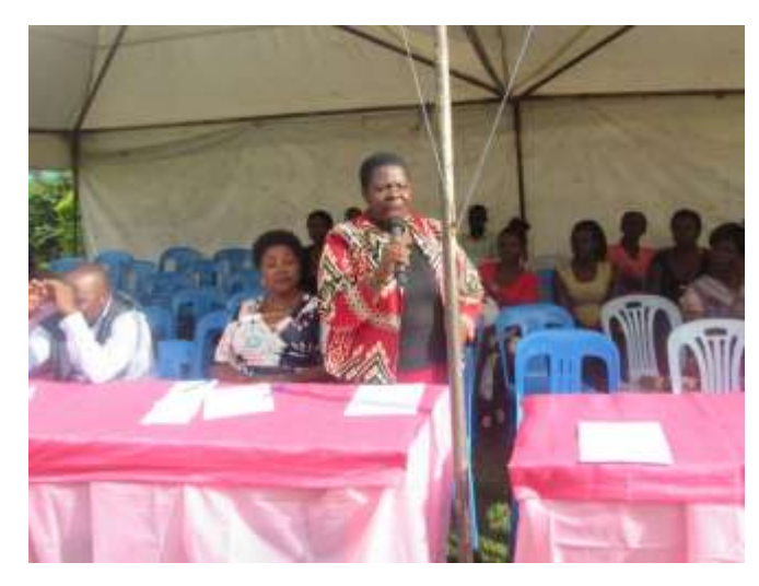
Fig4. Hon Kyowa Silvia District Woman Councilor making remarks during the community baraza in Mukono