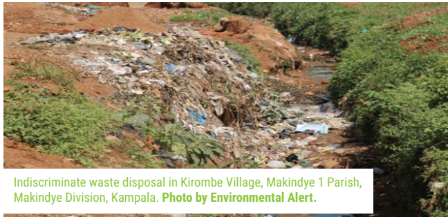
Indiscriminate waste disposal in Kirombe Village, Makindye 1 Parish, Makindye Division, Kampala.

In Kampala City for instance, the daily per capita waste generation is estimated at 1 Kgs. This means that with an estimated day population of 4.5 million people, Kampala generates about 45,000 tons of waste per day! According to Kampala Capital City Authority (KCCA), about three quarters of the waste generated in the city is organic. The remaining proportion constitutes glass, paper, plastic, metals and other construction waste. Thus, with plastic waste constituting 1.6% (indicated in Figure 1).