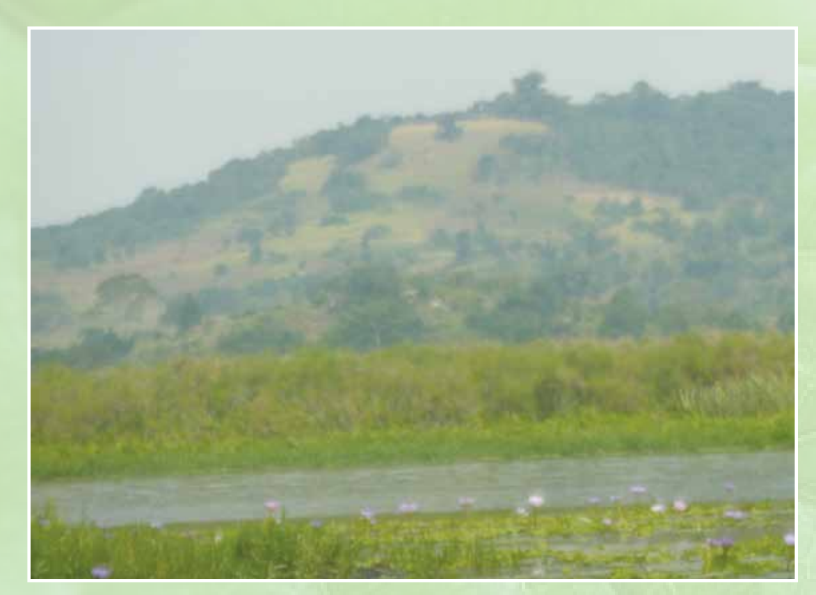
Nansubuga Hill located within the Mabamba Ramsar site Wetland catchment in Kasanje, Wakiso district.

The 5 year National Development Plan (NDP 1) that is remaining with one year of implementation, prioritized the promotion of sustainable use of the environment and natural resources for the benefit of the population. The NDP 1 classified environment and natural resources among the primary growth sectors that directly produce goods and services to support development. Unfortunately, the current state of our environment and natural resources does not measure up to the provisions and aspirations of the population as expounded in the NDP 1. This is mainly due to the low funding of the Environment and Natural Resources sub-sector. Consequently, there is deteriorating governance of the ENR sub-sector characterized inadequate management regimes, poor enforcement and compliance level and involvement of communities in the governance and management of the