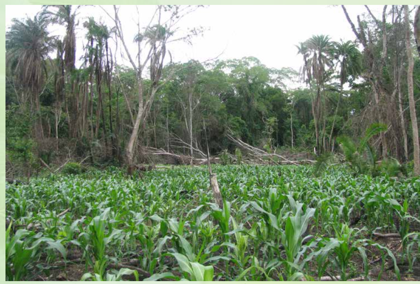
Escalating forest degradation in a private forestry in Kyebando Sub-county in Kibaale district.

ver 90% of the Ugandan population directly or indirectly depends on products and services from environment and natural resources (ENR). Currently ENR contribute over 50% of the country's gross domestic product and the sector contributes more than 92% of energy requirements for the country (National Forest Plan, 2013) ENR form a major source of employment to millions of Ugandans (both formal and informal) and are a key source of raw materials for industries. They as well contribute towards food security, revenue generation and foreign exchange earnings through tourism.